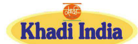
Khadi and Village Industries Commission Ministry of Micro, Small & Medium Enterprises, Government of India