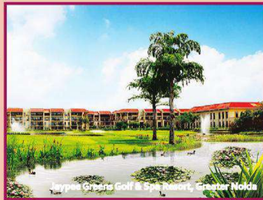
Jaypee Greens Golf & Spa Resort, Greater Noida