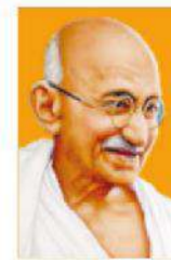
Run by: Gramodaya Ashram