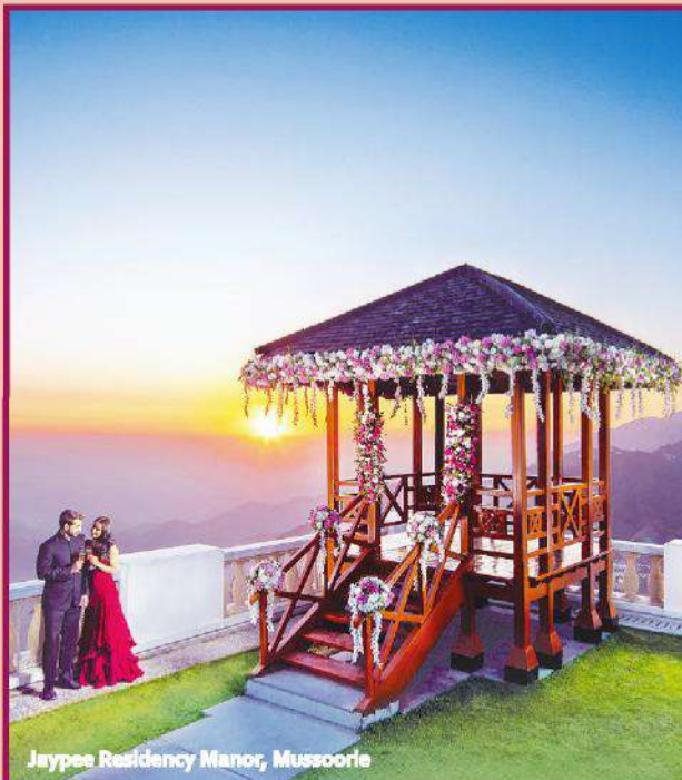
Jaypee Residency Manor, Mussoorie